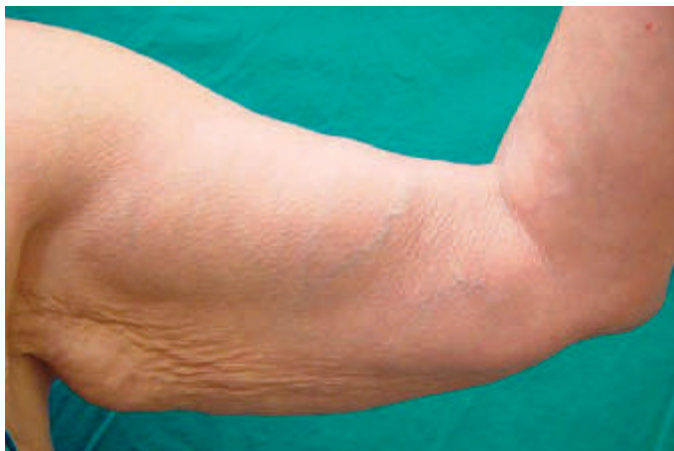
Figure 6a. Preoperative skin laxity of arm.