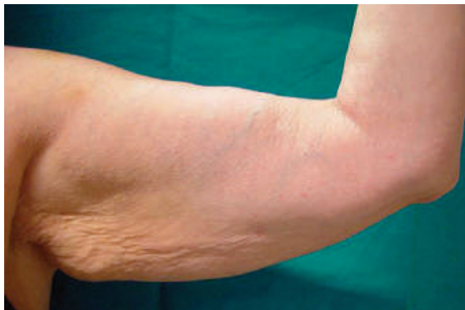
Figure 6b. Postoperative view after 6 months.