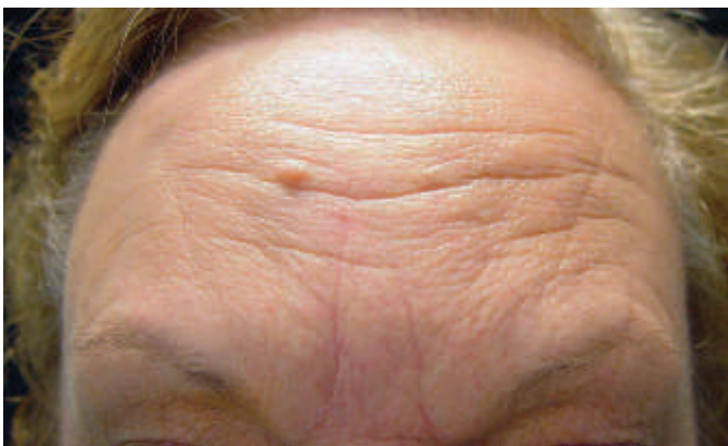
Figure 5a. Preoperative forehead wrinkles.