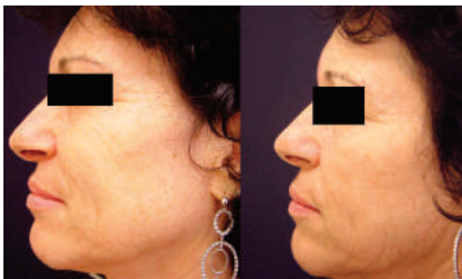
Figure 8. Pre- and postoperative view of face skin laxity.

were not used, patients could perceive any exceeding electrothermal effect, thus preventing any complications.