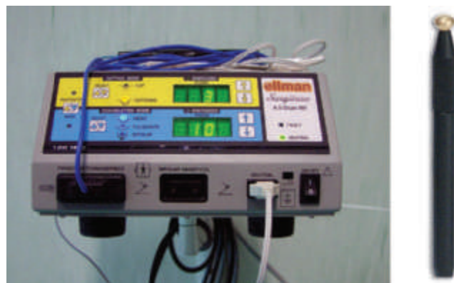
Figure 1. Surgitron Dual Frequency™ RF and spherical handpieces.

The Surgitron Dual Frequency RF heats tissue using a proprietary method of coupling monopolar RF to skin by a thin capacitive membrane that distributes RF energy over a volume of tissue beneath the membrane surface. The components of the device include: 1) an RF generator producing a 4-MHz alternating-current RF signal, the energy level of which is set by the clinician; and 2) a handpiece for direct-