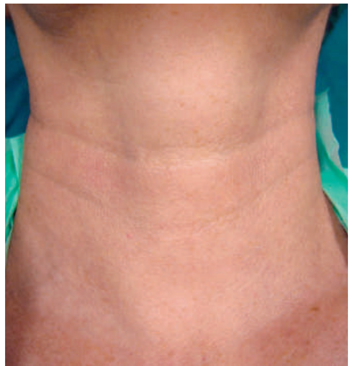
Figure 3b. Postoperative view of neck.

In order to diminish the side effects (ie, small abrasions healing in 3–4 days) it is important that the patient remain still during treatment. After treatment, an antidystrophic and restoring cream is applied. The degree of clinical improvement was independently determined by 3 blinded assessors who were randomly assigned comparative before and after treatment photographs using a quartile grading scale (0=less than 25%, 1=25% to 50%, 2=51% to 75%, 3=more than 75% improvement). At the end of the study, the subjects documented their degree of satisfaction on a scale of 1 (lowest)